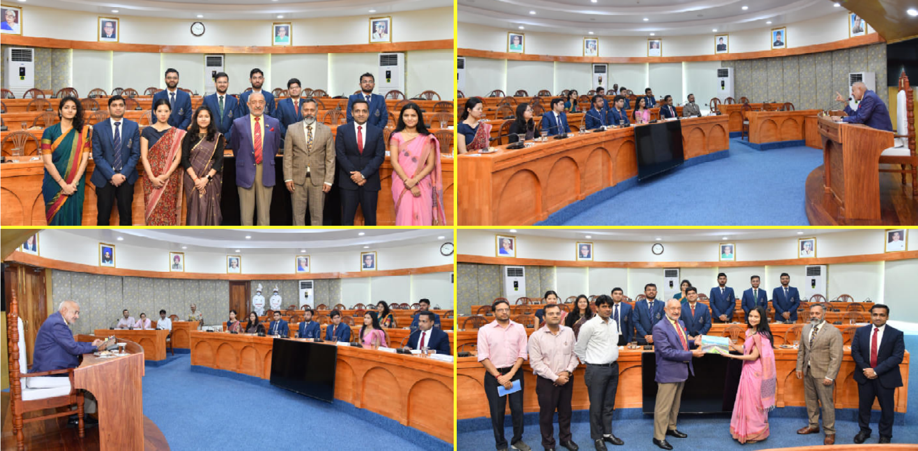
Indian Defence Accounts Service (IDAS) Probationers of 2022-2023 batch, as part of their Tri-Services Command attachment to Andaman & Nicobar Command currently on visit to Andaman and Nicobar Islands called on Admiral D K Joshi, PVSM, AVSM, YSM, NM, VSM (Retd.), Hon'ble Lt. Governor, A&N Islands and Vice-Chairman, Islands Development Agency today at Raj Niwas.